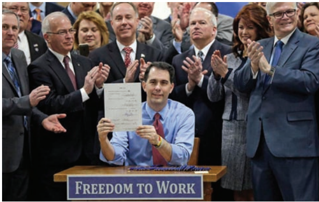
Gov. Scott Walker, a Republican, signed legislation that made Wisconsin the 25th state to prevent organized labor from requiring all workers to pay union dues or fees.

Then, for right-to-work advocates, came an even more memorable turning point: In November 2012, voters in Indiana (where a law was repealed in the 1960s) re-elected Republican legislative majorities even after labor leaders pledged to defeat them for passing a right-to-work law earlier in the year. On the same election night, voters in Michigan rejected a labor-backed ballot measure to enshrine collective bargaining rights in the State Constitution.